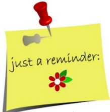
Chart of Accounts, HR Reporting Structure, and Departmental Systems Preliminary Plans due May 15

Questions? Drop by Tate Center Room 138 during office hours.